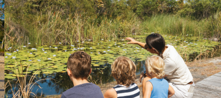
JUNIOR ECO RANGERS

NEW! Illumina Light Show: Looking for something to do after dark? Visualise the brilliance of the world's largest sand island with Illumina, the all-new light and sound spectacle at Kingfisher Bay Resort. Meet at Reception. Adult $50/Child free.