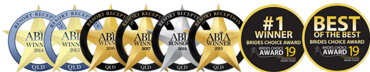
A string of accolades for the Kingfisher Bay Resort Team