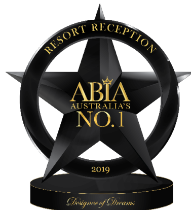
National ABIA Award for Best Resort Reception.