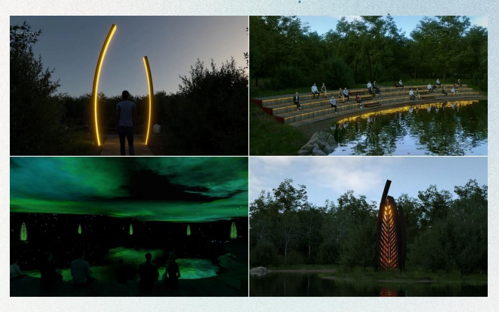
Guests will experience Illumina from a sustainably built amphitheatre, constructed in line with the resort's strict environmental guidelines.