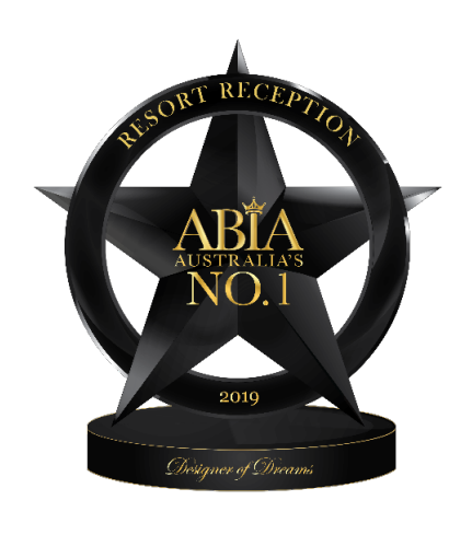
National ABIA Award for Best Resort Reception.