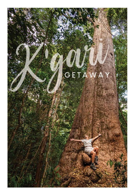
NEW: Three-day, two-night guided 4WD tour itinerary offers a local, curated adventure on Fraser Island.