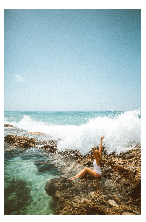
HIDDEN GEMS: Explore lesser-known locations such as the Champagne Pools - previously inaccessible from Kingfisher Bay Resort until now.