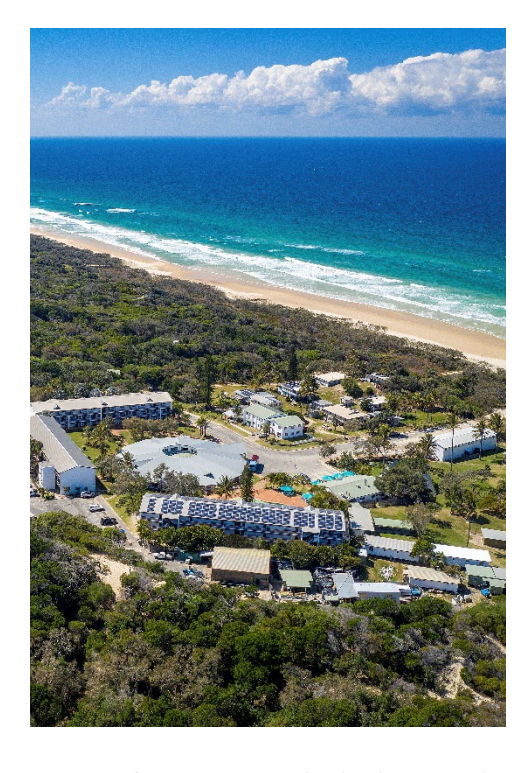
Eurong Beach Resort: Situated right along 75 Mile Beach, tour guests overnight here, ready for day two of their island adventure.